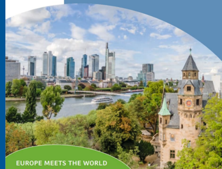
EUROPE MEETS THE WORLD

The congress will feature sessions with European subspecialties and sister organizations like the World Health Organization (WHO Europe), FIGO, and UNFPA. We will also welcome distinguished colleagues from related specialties. This event is an ideal opportunity to foster networking at all levels for the advancement of women's health.